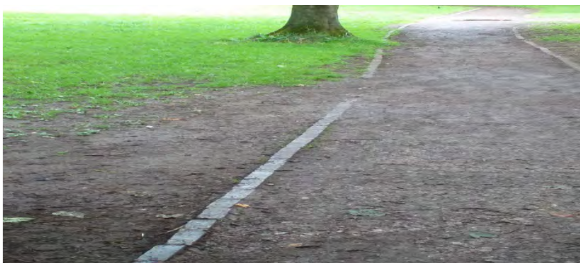
photo 1 shows the foot path that runs along the side of the river this is just a loose stone surface and is regularly flooded in the winter months.

The surface of the foot paths through the Priory Gardens is a mixture of tarmac and loose stone with some low lying areas with poor drainage and other areas of uneven and in some places broken tarmac. In the past approximately 80% of the footpaths through the Priory Gardens have been tarmacked but there is also the section that runs along the side of the river that never has been tarmacked and during the winter months is constantly flooded.