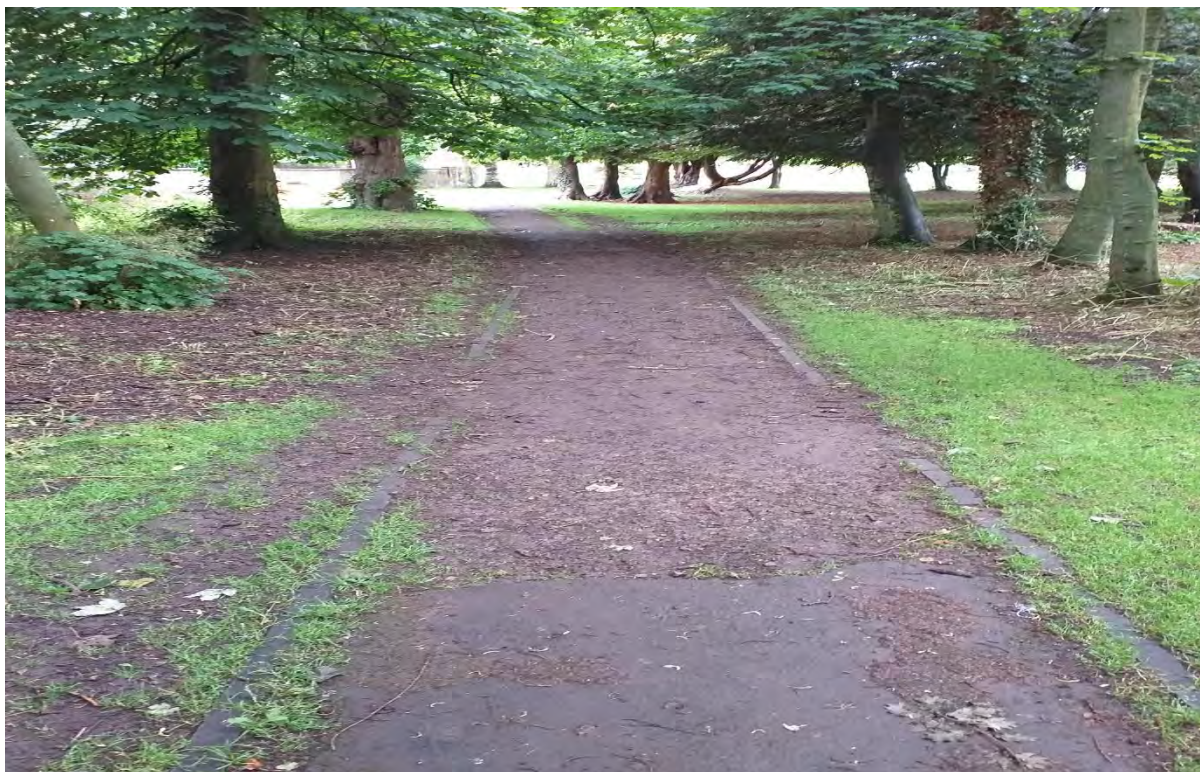
photo 3 shows the section from the pedestrian gate on Figgins Lane back towards the Priory car park. This section has in the past been tarmacked but is now starting to break up.