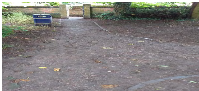
Photo 2 above shows the Figgins lane pedestrian gate entrance this area is constantly requiring the surface being topped up to prevent a trip hazard especially for the elderly that like to use the gardens.

photo 1 shows the foot path that runs along the side of the river this is just a loose stone surface and is regularly flooded in the winter months.