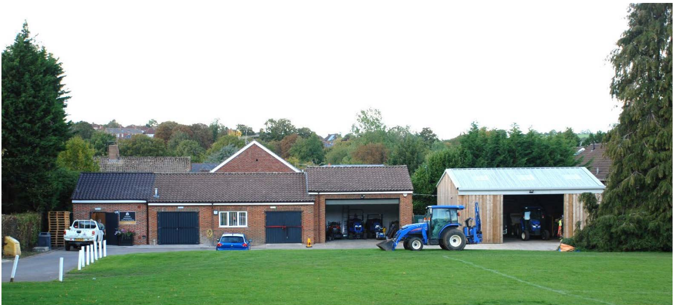
A side extension to the left and new storage barn to the right