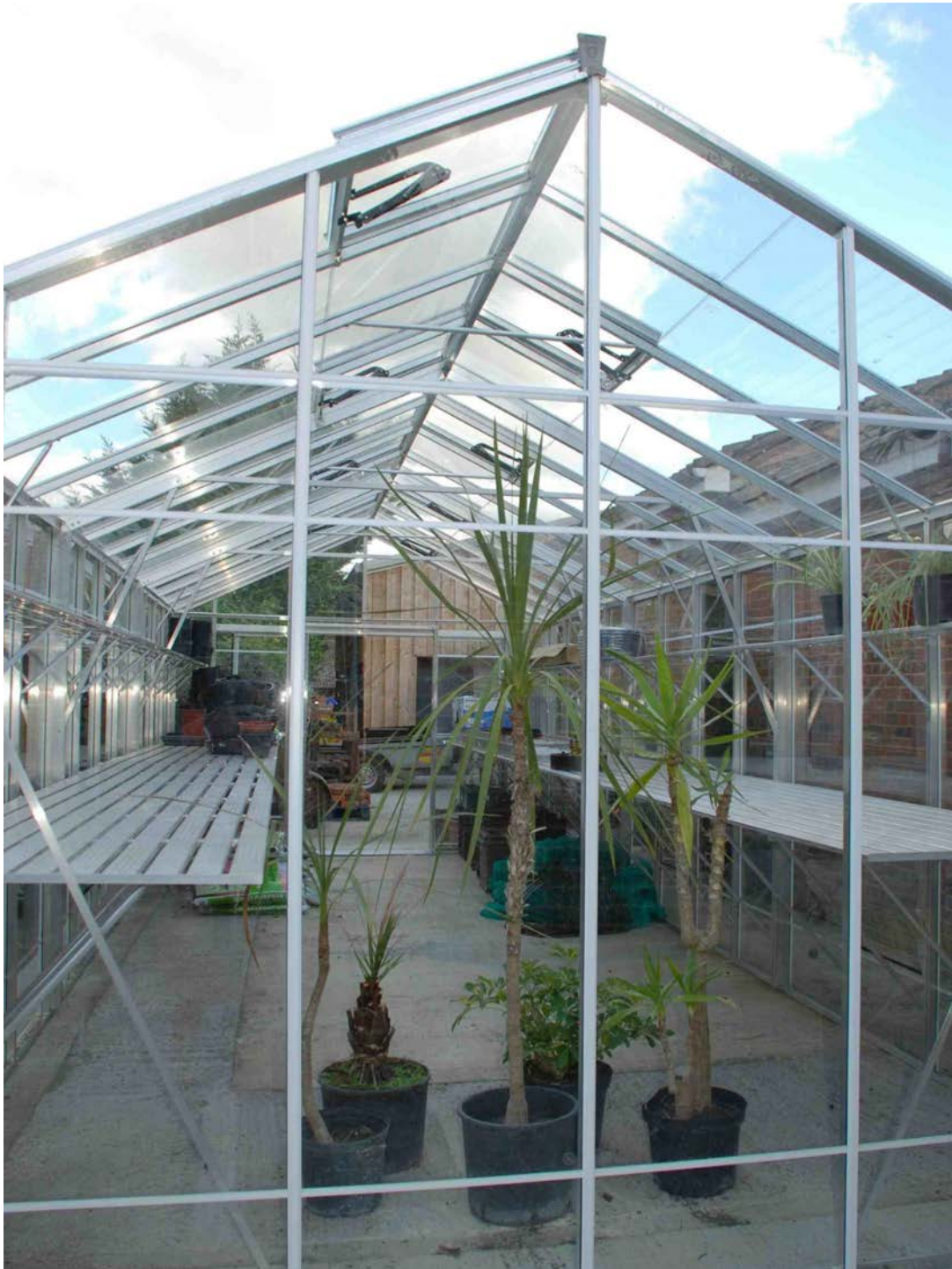
A much bigger greenhouse has been added to the rear