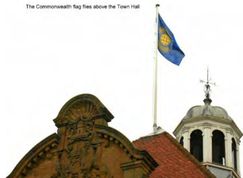
The Commonwealth flag flies above the Town Hall

Full Council on the 9 th March dealt with many issues facing the town including some legal ones concerning the Mop Fairs and Jazz Festival, a strategy for the town's three water meadows and a report on a meeting between the signatories of the Community Covenant and 4MI Battalion. Council also discussed the Annual Parish meeting which is on 27 th April 7.00 pm (hope you will come along), policies for our small grants scheme and for charging for use of the town's outside